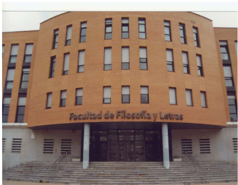
Faculty of Philosophy and Literature, University of Valladolid

In general tapas bars and taverns are not expensive. Calle Paraiso and its surroundings offer an exciting night-life for students and young people. You can find a number of bars with tapas, wine and beer.