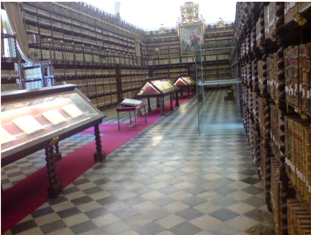
The Library of Cardinal Mendoza