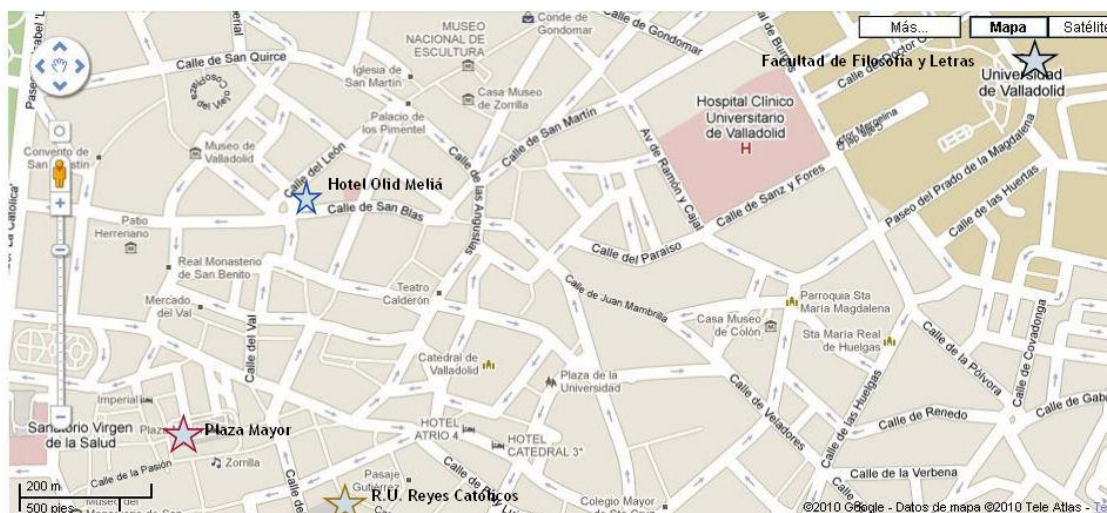
Map of Valladolid City Centre, with hotels and hostels.