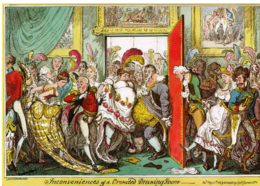
reference: File:G. Cruikshank, Inconveniences of a Crowded Drawing Room, 1818

jointly organized by the University of Manchester, the Centro Interuniversitario per lo Studio del Romanticismo (University of Parma), and Bath Royal Literary and Scientific Institution